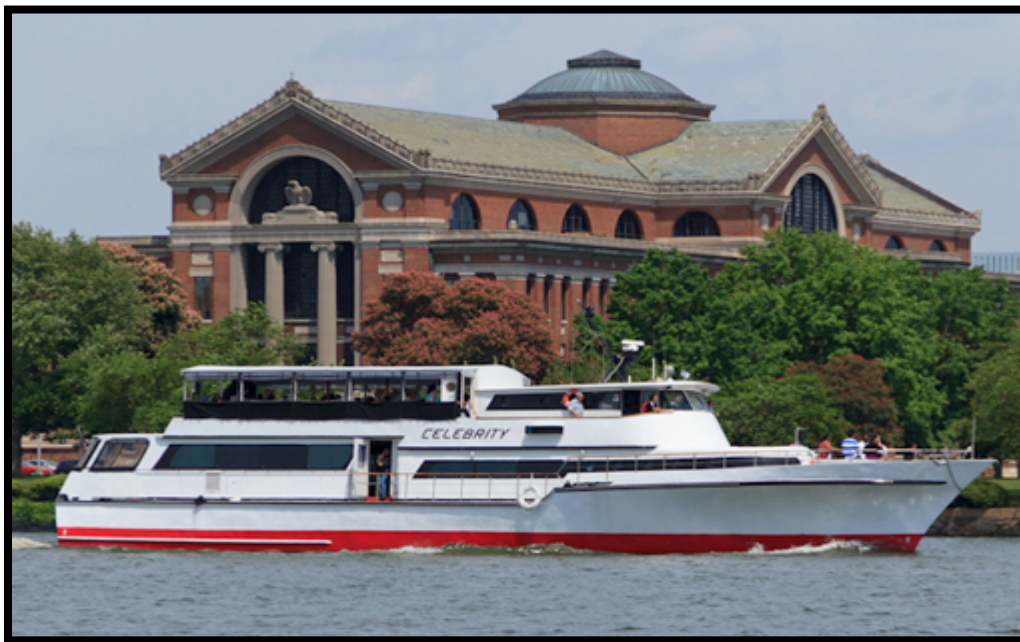
Photo of Celebrity , the second largest yacht in the Capitol Yacht Charters fleet.